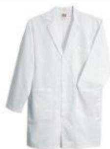
5033 LAB COAT