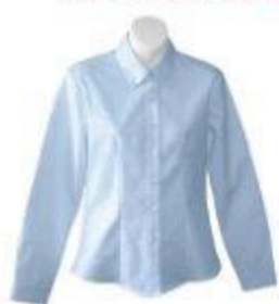
1063 BLUE (Prefects)